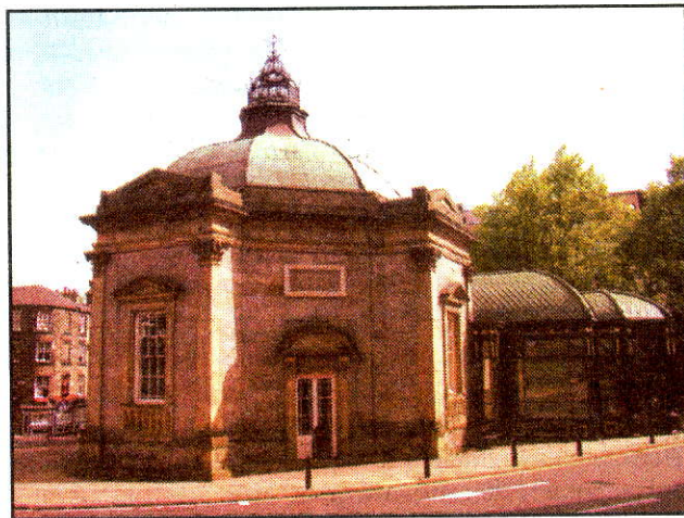
The history of Harrogate's dalliance with medicinal waters is preserved in the Royal Pump Room Museum on Crown Place.

And if you're exhausted after all that, tuck yourself into bed at the ivy-clad Old Swan Hotel, just like Agatha did.