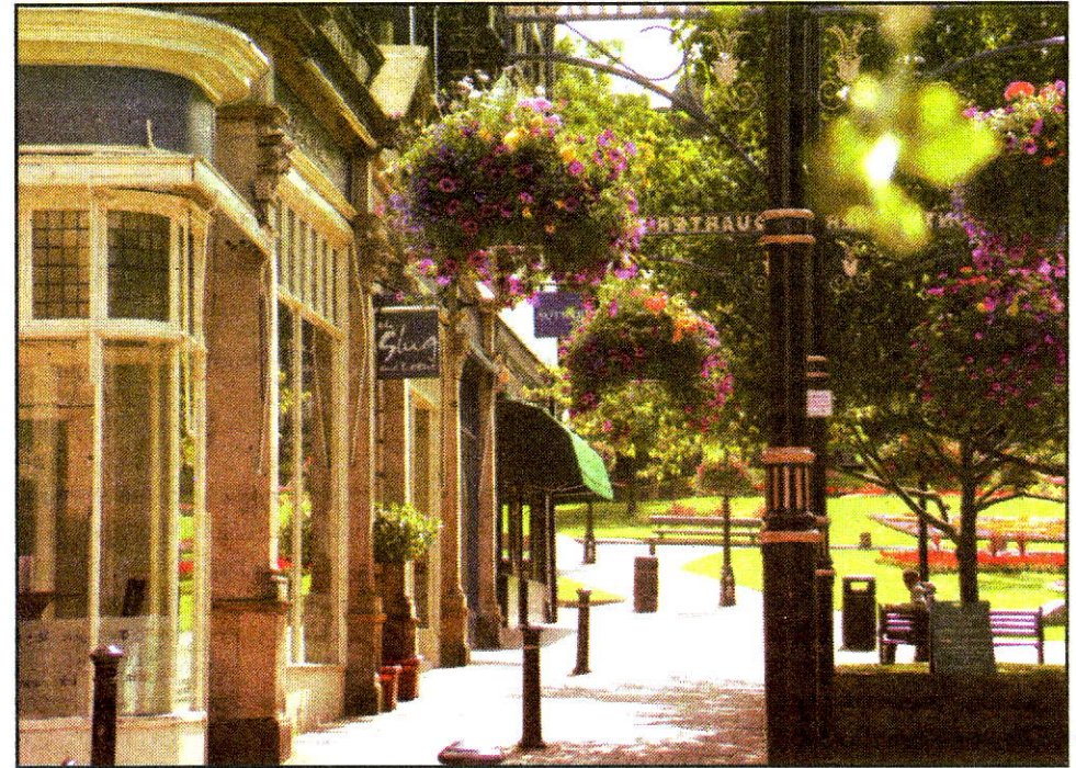
Greenery and scenery: Montpellier Gardens.

Outside, meanwhile, it's as though someone build Harrogate on a giant bed of steroidal vegetation that bursts through every crevasse. The expanses of The Stray wrap three sides of the centre in a green blanket, whilst the paths of the Valley Gardens wander between acres of trees and flowerbeds. But the true monarch of this floral world is definitely Harlow Carr, one of the Royal Horticultural Society's four UK flagship gardens. It even has its own branch of Betty's for those who can't bear to choose between pointing at flowers and daintily working on tea and cake.